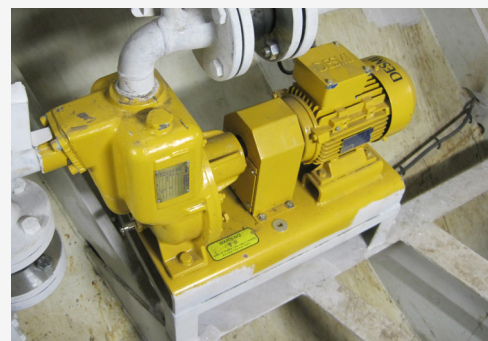
DESMI SA Centrifugal pump installed onboard a new river cruise ship.

The types of DESMI pumps used at Den Breejen Shipyard are centrifugal pumps, type VAC, SA & ESL.